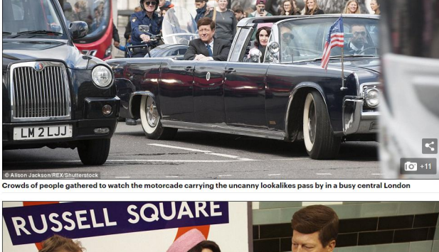
Ms Jackson said: 'The assassination of JFK remains one of the single most iconic, shocking and recognisable moments in modern history'