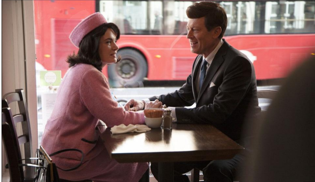
The exceedingly good lookalikes were shooting the latest series by photographer Alison Jackson who is known for her spoof works