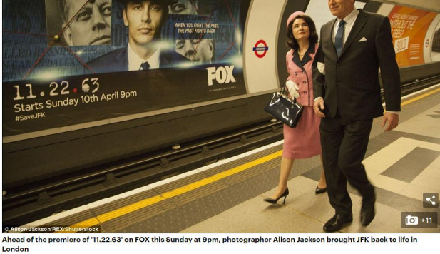
Passersby were understandably shocked when when they spotted former US President JFK and wife Jackie in her iconic pink Chanel suit waiting on the platform at Russell Square