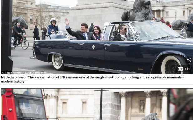
John Fitzgerald Kennedy, commonly referred to by his initials JFK, was the 35th President of the United States from January 1961 until his assassination in November 1963

Today, her work sells for hundreds of thousands of pounds and appears in publications across the globe.