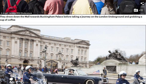
They drove down the Mall towards Buckingham Palace before taking a journey on the London Underground and grabbing a cup of coffee