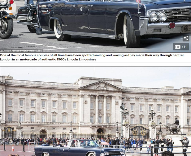
One of the most famous couples of all time have been spotted smiling and waving as they made their way through central London in a motorcade of authentic 1960s Lincoln Limousines

Only on close scrutiny does it become evident that the shots were posed by lookalikes.