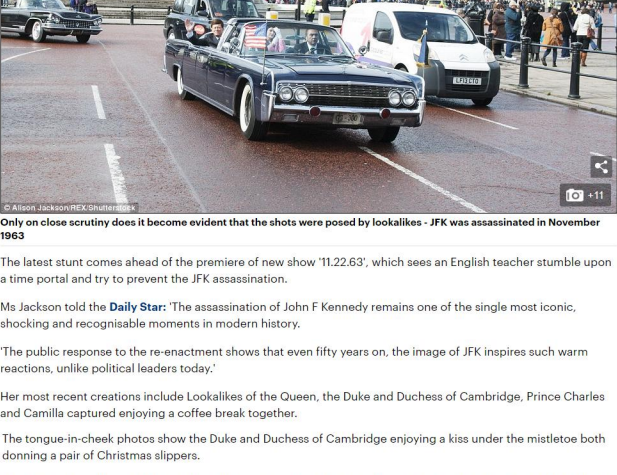
Only on close scrutiny does it become evident that the shots were posed by lookalikes - JFK was assassinated in November 1963

The latest stunt comes ahead of the premiere of new show '11.22.63', which sees an English teacher stumble upon a time portal and try to prevent the JFK assassination.