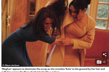
'Meghan' appears to dominate the scrap as she wrestles 'Kate' to the ground by her hair and pulls her across the floor of what looks like a palace

The pair then tug on each others' shoulders with menacing looks on their faces.