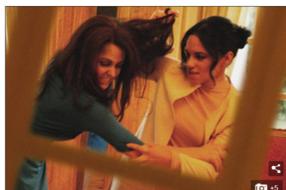
The 'royals' wear menacing looks in the spoof of the royals' rumoured rift. Kensington Palace has repeatedly denied any fallout between the duchesses