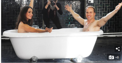
The Duke and Duchess's doubles perform a version of Papageno's duet from Mozart's The Magic Flute while photographer Alison Jackson said: 'I set it in the bath for added intimacy'