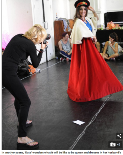
In another scene, 'Kate' wonders what it will be like to be queen and dresses in her husband's cap and robes