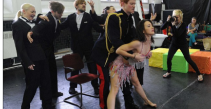
The sight of 'Harry' cavorting with a stripper echoes the time he was snapped in a Las Vegas hotel room