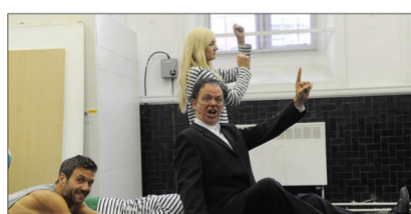
Charles Saatchi aboard a makeshift gondola laments his woes over a paparazzi photo

'Lawson' and 'Saatchi' perform O Sole Mio . They pass each other on gondolas in Venice and she thrusts an ice cream into his face.