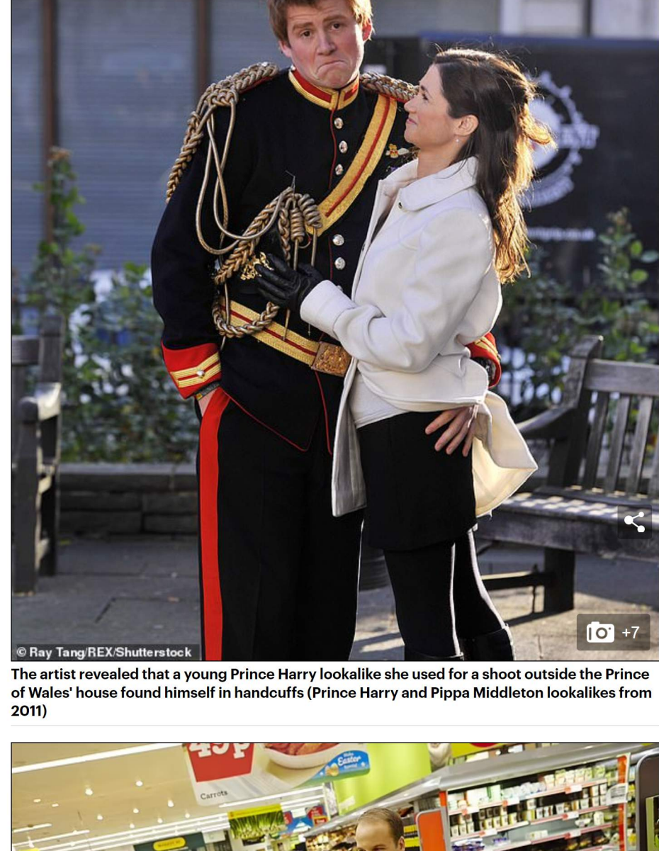
The artist revealed that a young Prince Harry lookalike she used for a shoot outside the Prince of Wales' house found himself in handcuffs (Prince Harry and Pippa Middleton lookalikes from 2011)