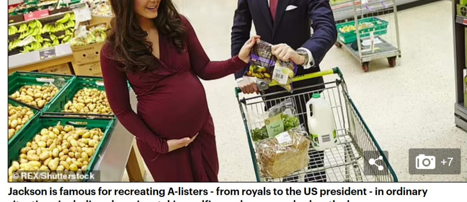
Jackson is famous for recreating A-listers - from royals to the US president - in ordinary situations including shopping, taking selfies and even perched on the loo

Alison, whose outrageous images include a lookalike Meghan Markle wrestling a fake Duchess of Cambridge to the floor by her hair, previously revealed that she often chases people down the street if they have the celebrity 'look' she wants.