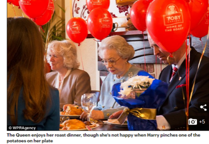
The Queen enjoys her roast dinner, though she's not happy when Harry pinches one of the potatoes on her plate

The family are shown sitting at the table Kate decorated enjoying their plates of food, toasting the Queen's birthday with a 'hip hip hooray!' all round. Camilla particularly is enjoying a drink or two.