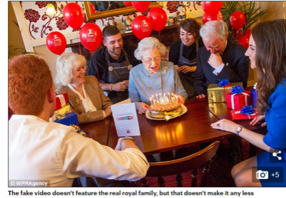
The fake video doesn't feature the real royal family, but that doesn't make it any less entertaining when they sing her happy birthday and watch the 'queen' blow out her candles

Shot from William's perspective, the candid clip shows the royal family start the nation's reigning monarch 90th birthday celebration a day early with help from a traditional British roast dinner at a Toby Carvery.