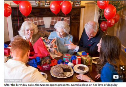
After the birthday cake, the Queen opens presents. Camilla plays on her love of dogs by presenting her with a photo frame featuring two corgis and a Union flag cushion

As the birthday cake arrives - a chocolate confection covered in hundreds and thousands - the royal family cheer and she blows out her candles and opens her presents.