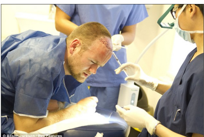
Beauty is pain: 'Wayne Rooney' undergoes a painful hair transplant, as imagined by artist Alison Jackson

This is how artist Alison Jackson imagines the star footballer's eight-hour hair transplant went, anyway.