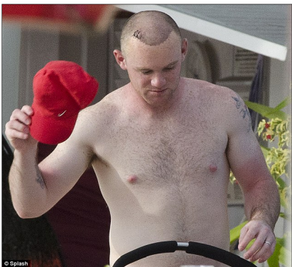
Recovering: Wayne exposed his new hairline on holiday in Barbados

Alison Jackson is well known for her parody pictures of the Royal family, and celebrities like David and Victoria Beckham, Elton John and Cheryl Cole.