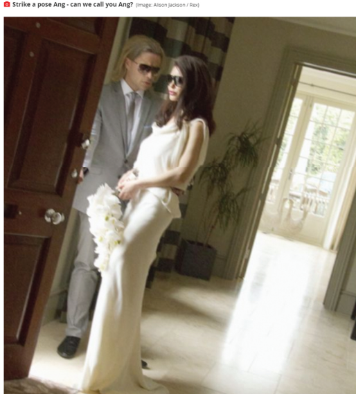
Presumably this is after the (pretend) wedding, and that's why they're together