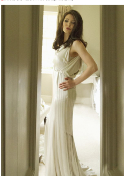
Strike a pose Ang - can we call you Ang?