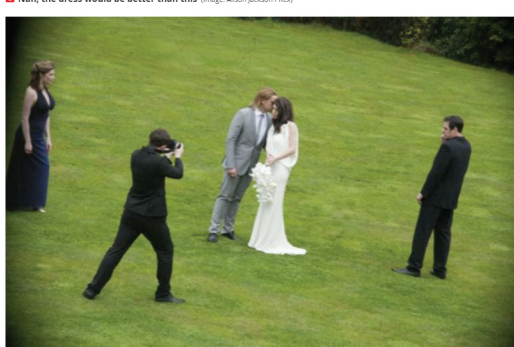
and the venue would be better than this