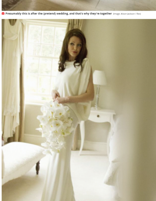
Oooh nice flowers...