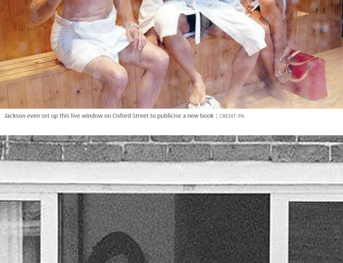
Jackson even set up this live window on Oxford Street to publicise a new book