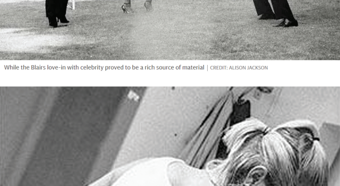
While the Blairs love-in with celebrity proved to be a rich source of material | CREDIT: ALISON JACKSON