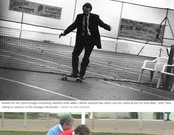
Known for her spoof images involving celebrity look-alikes, Alison Jackson has often cast her satirical eye on Tony Blair, 'seen' here trying to connect to the younger electorate

A collection of the satirical celebrity look-alike images created by Alison Jackson