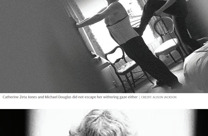
Catherine Zeta Jones and Michael Douglas did not escape her withering gaze either