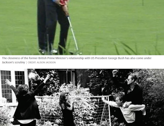
The closeness of the former British Prime Minister's relationship with US President George Bush has also come under Jackson's scrutiny