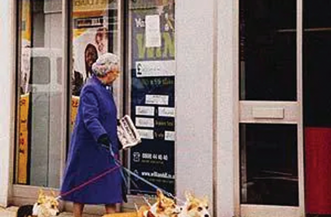
Even 'the Queen' appeared in the most unlikely of places