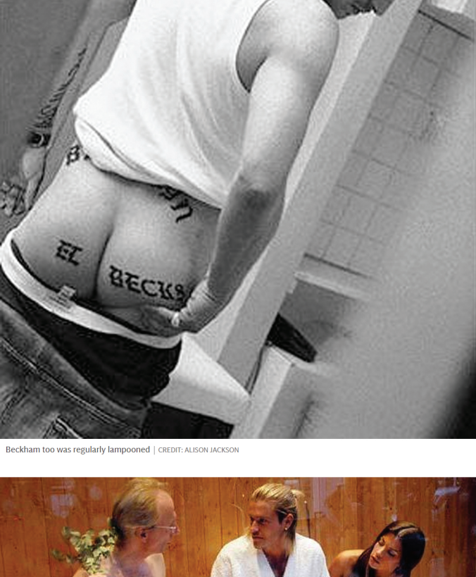
Beckham too was regularly lampooned