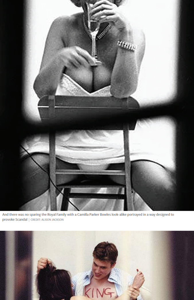
And there was no sparing the Royal Family with a Camilla Parker Bowles look-alike portrayed in a way designed to provoke Scandal